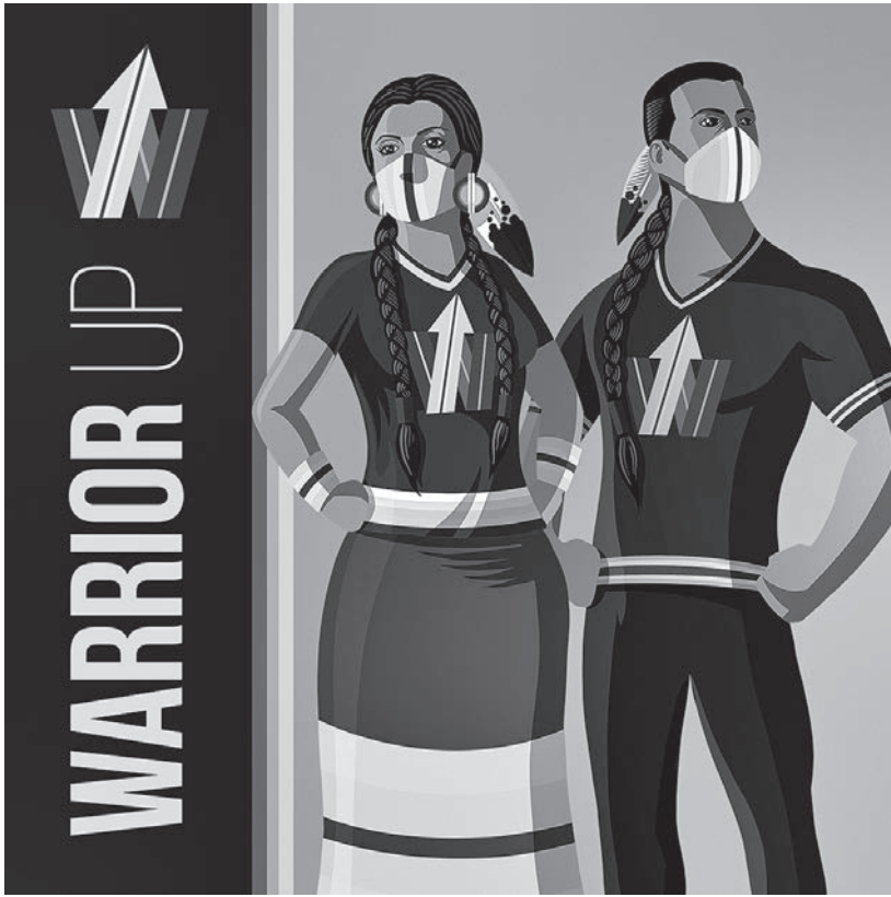
Fig. 3: Warrior Up campaign, IllumiNative, 2020. (Original color image reproduced in black and white for publication)

Native Americans have also turned to the internet to continue engaging in cultural practices that require people coming together. Virtual beading circles, drum socials, along with other forms of online engagement, have been viewed as a means to promote the mental well-being of community members, which is inextricably intertwined with communal practices of Indigenous culture. 66 Some Native communities, such as the Mashantucket Pequot, have used virtual formats to host intergenerational gatherings where the elders tell traditional stories, or to host Pequot language bingo nights to work toward preserving both Pequot lan-