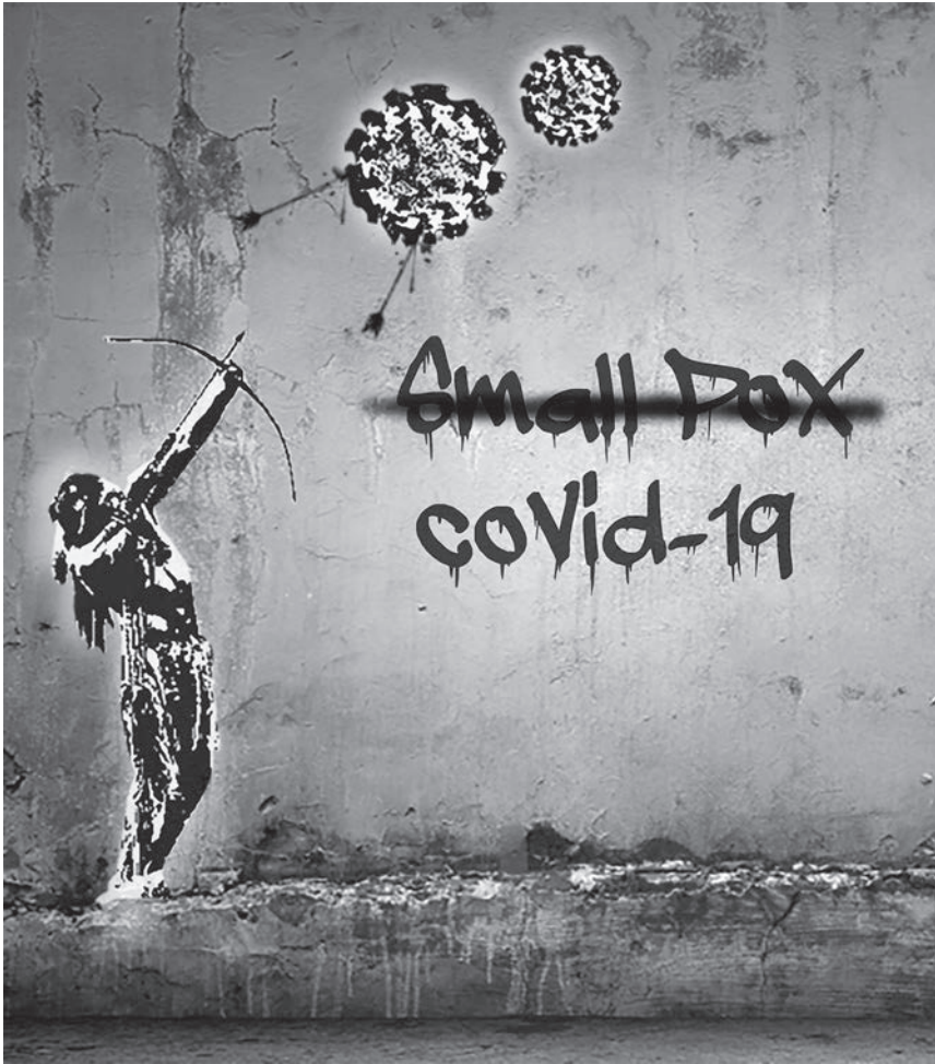
Fig. 2: Steven P. Judd, Street Art, 2020. (Original color artwork reproduced in black and white for publication)

to Indigenous artwork, comedy, and storytelling to empower Native Americans across the United States.